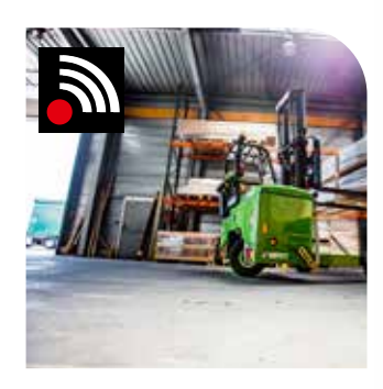
Keep track of upcoming preventive maintenance needs based on equipment usage.